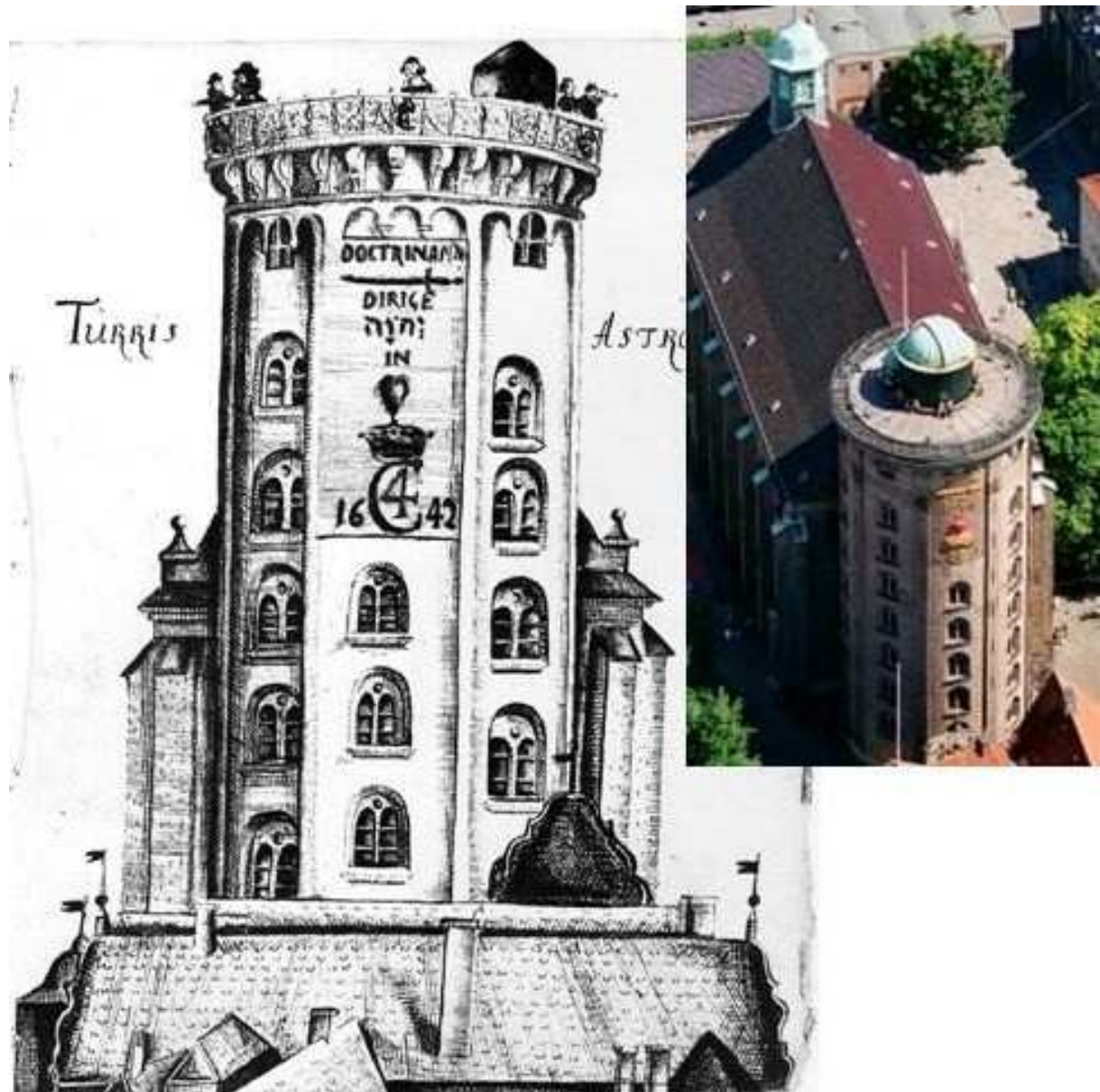
Figure 3. The Rundetårn (Round Tower) in Copenhagen at the time of Rasmus Bartholin and of Julius Reichelt's visit (1666), and nowadays (© Rigsarkivet, reproduced with permission, & A. Heck). The whole sky can be viewed from the large terrace that can also accommodate large-size instrumentation.

tronomy. Interestingly, he de facto established standards for the confirmation of discoveries of celestial objects and phenomena. While he preferred non-optical instruments (sextants, etc.) for precise astrometric measurements, Hevelius built refractors for mapping the Moon as well as for other observations. The focal lengths of those described in his book Machina Coelestis (1673) could reach 50 m (see Figure 4) and contained open tubes to reduce flexing and wind problems. His observatory, Stellaeburgum , rebuilt several times after destructive fires, was visited by monarchs as well as