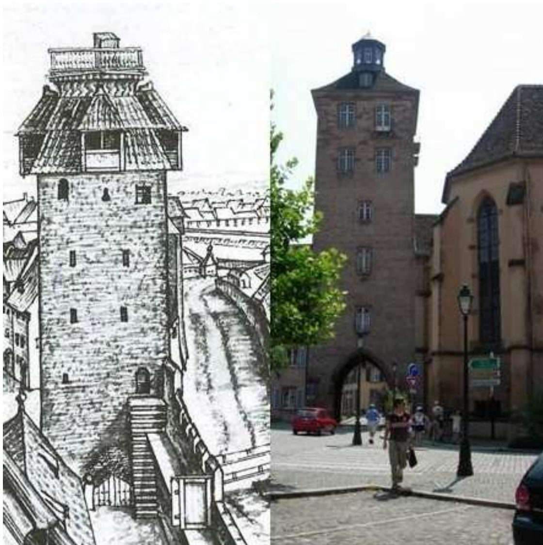
Figure 1. The top of Strasbourg Hospital Gate before it was covered by the turret lantern (1671 pen-and-ink sketch by Joh. Jacob Arhardt) and nowadays (© Cabinet des Estampes , reproduced with permission, & A. Heck).

aspect of the tower did not change over the centuries. Figure 1 compares a current view with a 1671 pen-and-ink sketch by Arhardt showing the top of the tower shortly before it be covered with the turret. The structure visible then on the terrace is likely a shelter (perhaps for watchers, equipment or access stairs).